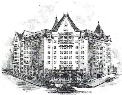
THE MACDONALD EDMONTON, ALTA.