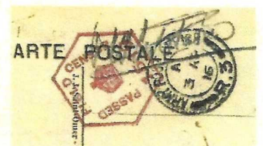
Fig. 4 APO ~ British type 4 censor mark