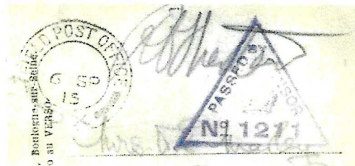
Fig.2 FPO - HQ 1 st Div type 3 censor mark