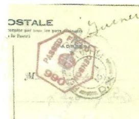
Fig.3 FPO - HQ 1 st Div. type 4 censor mark