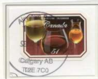
Used Wine Stamp issued 2006