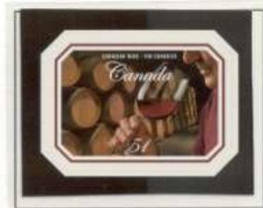
Mint Wine Stamps issued 2006