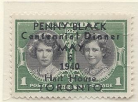
1¢ with Toronto Stamp Club o/p

The Canadian Stamps: The Canadian Bank Note Co. produced these 3 stamps to commemorate the Royal Visit.