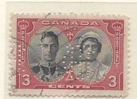
3¢ with International Harvester Perfin

Special Royal Train Postmark: A 'Royal Standard' flag cancelling die was made by Pritchard and Andrews of Ottawa, for use with a Perfect cancelling machine in the Royal Train post office.