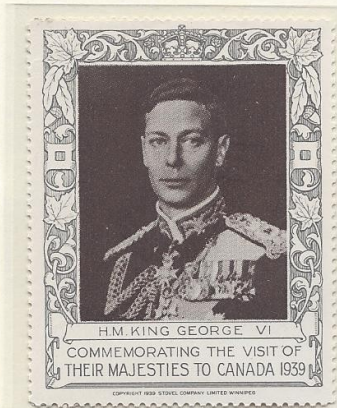
Stovel Co. poster stamp showing King + Winnipeg cinderella.

Cinderella Stamps: Several firms made cinderella stamps Plate Blocks: In total, 166 different plate blocks are known for the 3 Royal Visit stamps.