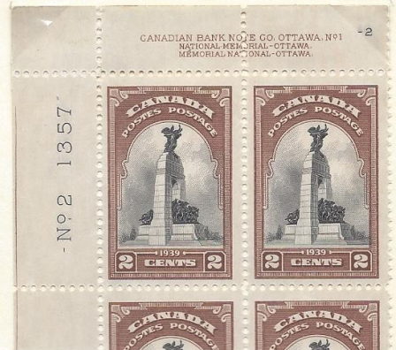
2¢ Plate 1-2 UL plate block.

Meter Advertising Slogans: Many companies purchased special advertising slugs for their meter machines.