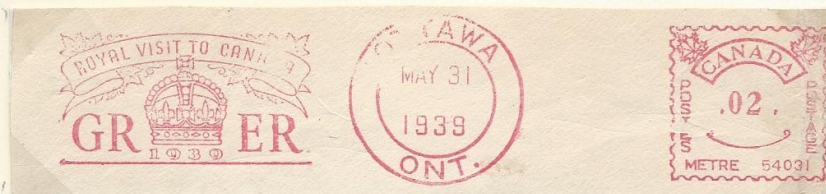
A Pitney Bowes PB5.1 Advertising Meter used by the Charles Ogilvy Company in Ottawa.

Meter Advertising Slogans: Many companies purchased special advertising slugs for their meter machines.