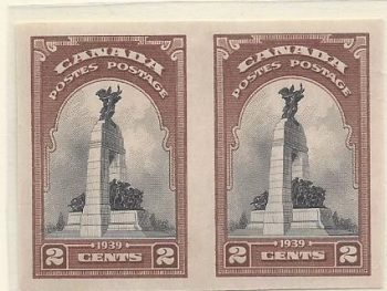
2¢ Imperforated Pair