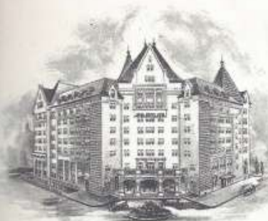
THE MACDONALD EDMONTON, ALTA.